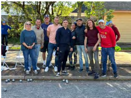
Players gearing up for an epic weekend of pétanque

Sunday began with a round to sort the teams into 4 brackets. After that, the chase was on. Lose now and you're out. Lunch break was paella, made and served on-site, with huge proportions. This time the accompaniment was to Duo Gadjo , a talented French Jazz café style duet.