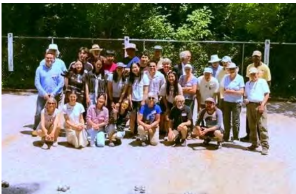
Global engagement at the local level

This kind of recruitment is hard work, but club members volunteer their time to these various events, and we've reaped the benefits of those hours by adding members to our ranks.