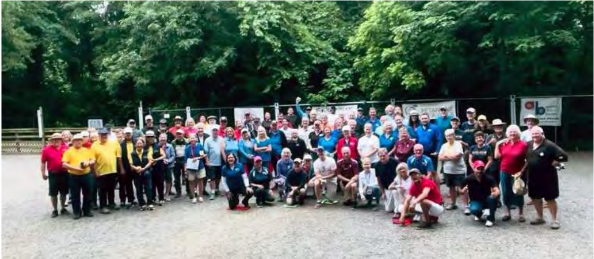
SE Mixed Triples Tournament hosted by Classic City Petanque Club - 27 teams representing 12 clubs across 7 states