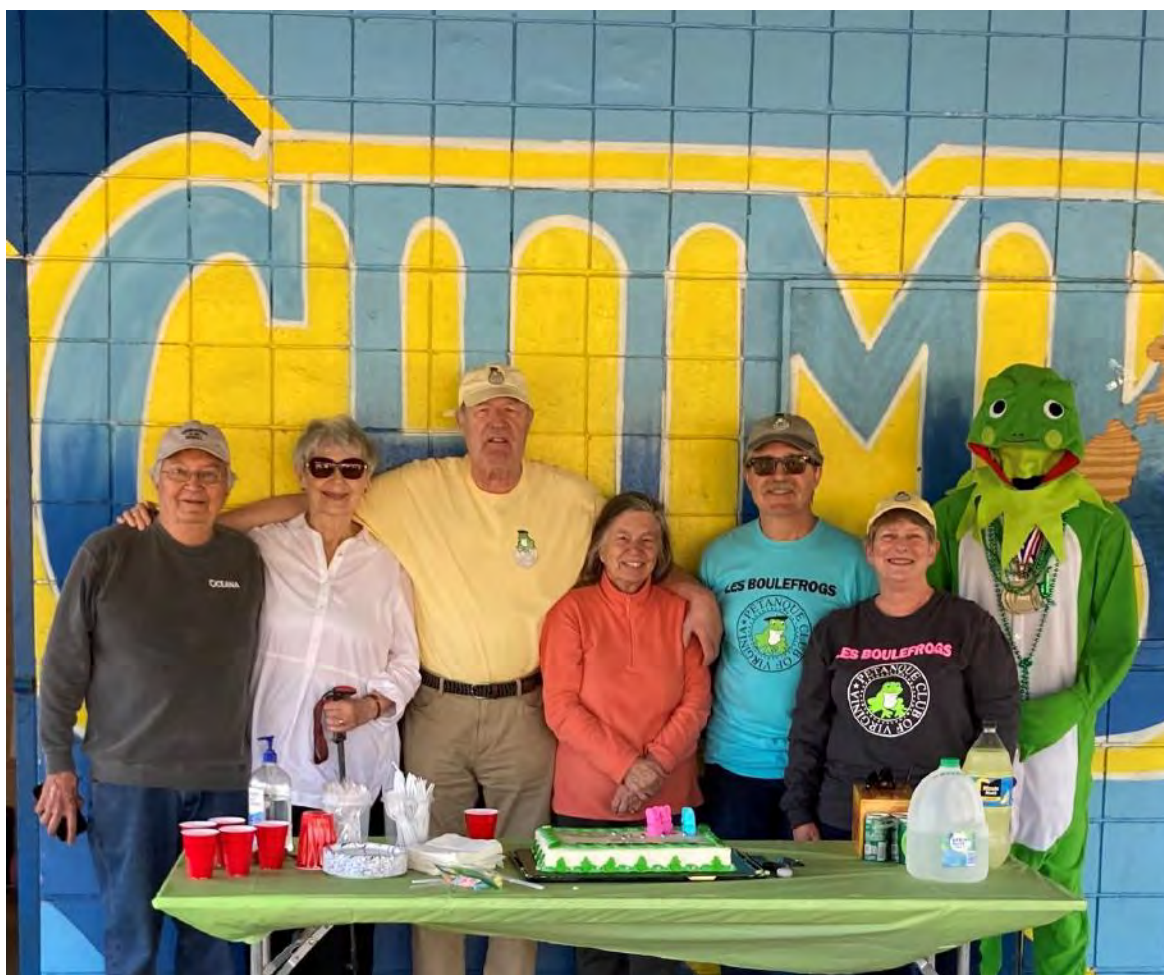
Members of Les Boulefrogs Petanque Club of Virginia