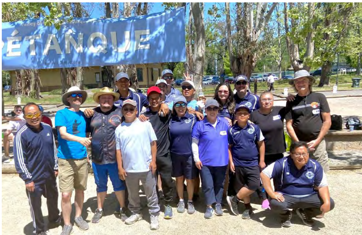
Sactown Crew and Associate Members at the Wine Country Open

Currently, Sactown members are preparing for the Interclub Tournament on July 7th, co-hosted by Lamorinda Pétanque and Fresno Pétanque . Teams from Northern California and Fresno clubs will vie for the coveted trophy and a cash prize for their club.