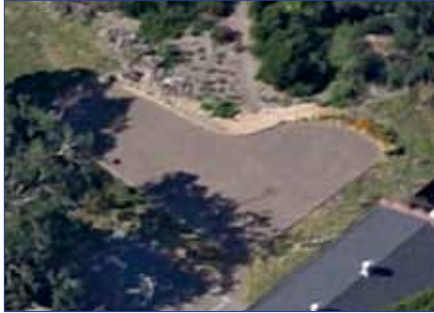
Oak Hill Park, Petaluma, CA