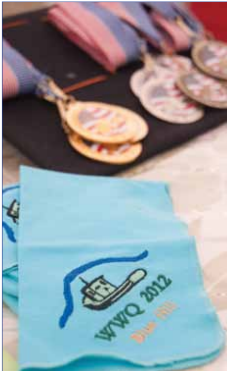
A nice touch from a gracious host club.

(September 8-9, 2012) Six teams — three from the East and three from the West — enjoyed a late summer weekend in the idyllic setting of Blue Hill, Maine. Their mission was to become the US representatives at the 2013 Women's World Championship.