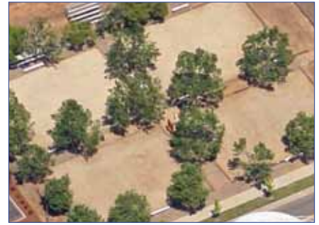
Mather Sports Center, Rancho Cordova, CA

Less obvious, and having more subtle effects, is the overall shape of your playing area. As apparent from these Google® satellite images, playing area dimensions vary greatly from club to club. In tournament play, direction and variety can be limited for practical reasons. But in casual games, try playing in all directions and using all areas of your terrain. If possible, play in some areas outside its boundaries. This can help you develop more techniques — and have even more fun!