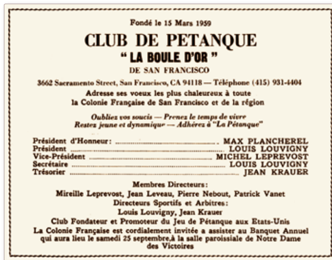
1982 banquet invitation from La Boule d'Or , FPUSA's longest standing club.