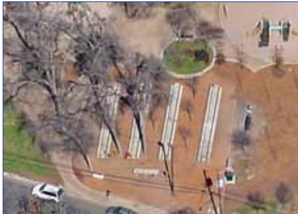
Pease Park, Austin, TX