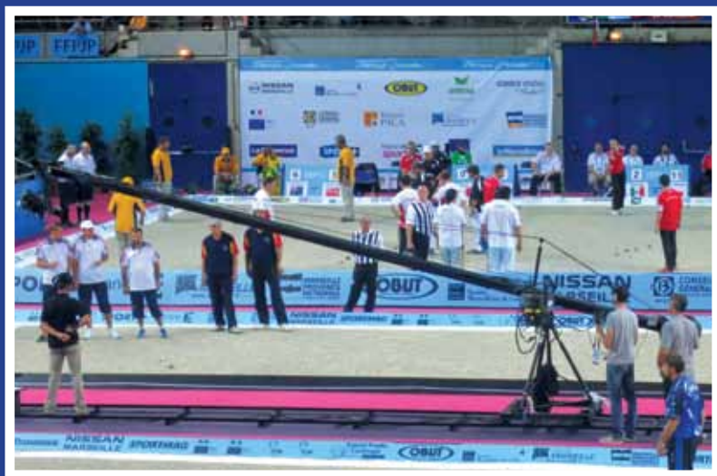
TV camera records eventual winners France play an elimination game vs. Spain.