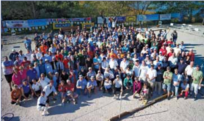
Petanque America Open participants, November 10, 2012