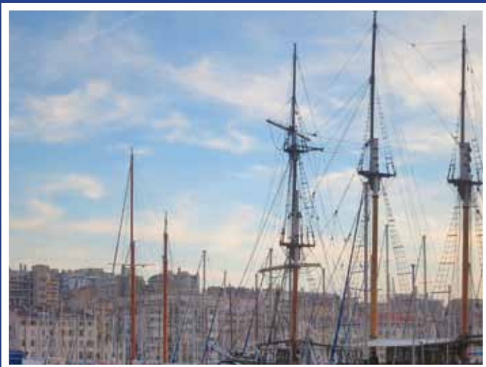
Marseille's old port was a picturesque backdrop for the event.