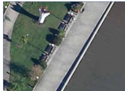
Cal Anderson Park, Seattle, WA