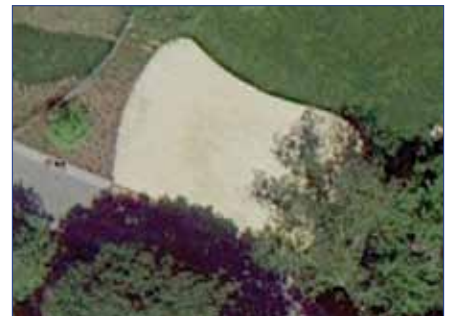
Washington Square Park, New York, NY