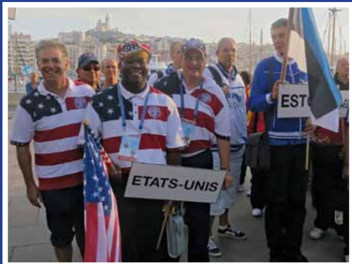
Our delegation queues up for the parade of nations.