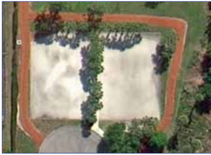
Lawton Chiles Park, Delray Beach, FL