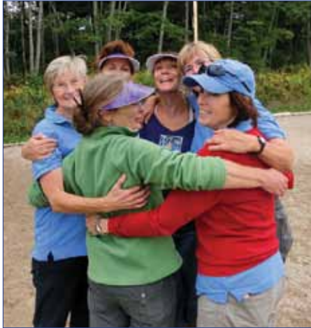
It looks like everyone was getting along just fine.