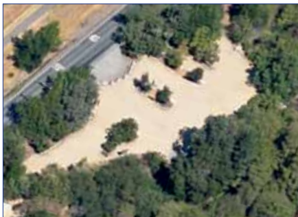
Lafayette Community Park, Lafayette, CA