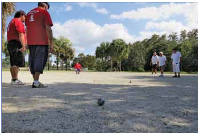
It was red against white in the all-Florida final.