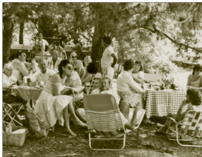
A simpler time? Picnic at La Pétanque Marinier , San Rafael CA, circa 1977.