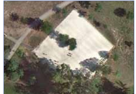
John Prince Park, Lake Worth, FL