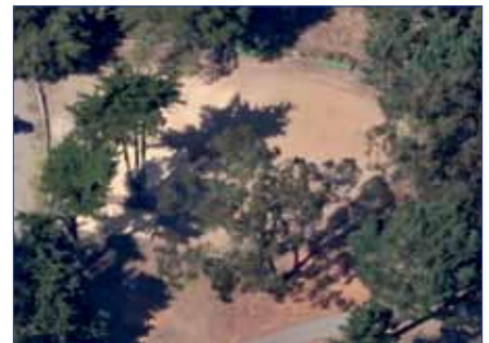
Golden Gate Park, San Francisco, CA