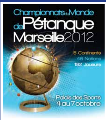
Official poster of the event.