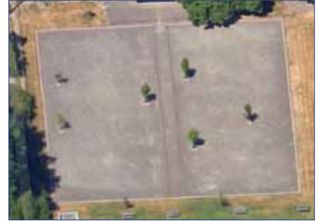
Westmoreland Park, Portland, OR