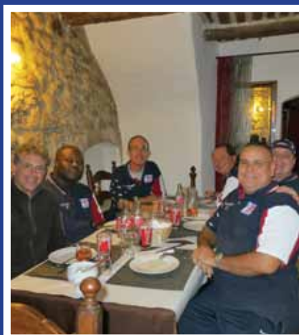
They ate... They played... They were merry!