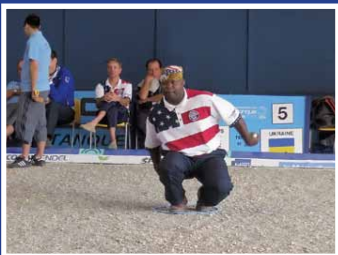
Ziggy points vs. Ukraine in La Coupe des Nations.