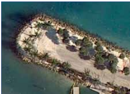
Dubois Park, Jupiter, FL

Most of us play on surfaces with a particular character or set of nuances. When we visit other clubs we pay close attention to these things, and the way that they differ from our home terrain. These are usually the things you get used to — or remember in frustration — about the various surfaces on which you play petanque.