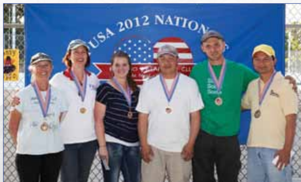
FPUSA National Singles Championship Women's and Men's Medalists Fresno CA, April 29, 2012