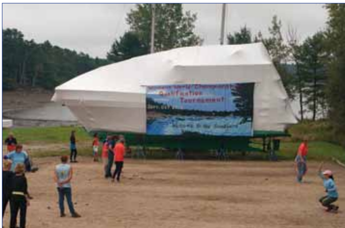
Overcast but balmy weather made for ideal playing conditions.